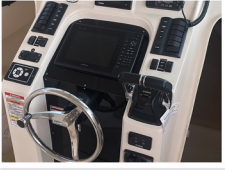
CENTER CONSOLE WITH GARMIN GPS, MARINE VHF, REMOTE CONTROL SEARCHLIGHT, ETC.

OFFICE ADDRESS: MANILA YACHT CLUB SHIPSTORE, 2351 ROXAS BOULEVARD, MANILA EMAIL: INFO@TRONQUEDBOATS.COM MOBILE: (63) 917 847 2733 WEBSITE: WWW.TRONQUEDBOATS.COM