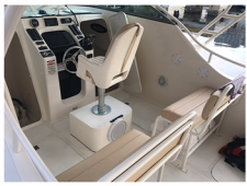
PILOT'S SEAT WITH TWO FORWARD SEATS