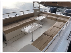
MULTIPLE SEATING WITH DRY STORAGE AND REMOVABLE TABLES

CRUISING SPEED : 32 KNOTS @ 4000RPM TOP SPEED : 40 KNOTS @ 5300RPM