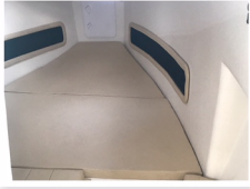
CABIN WITH MARINE AC